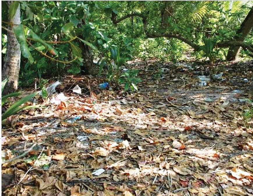
Waste on Vaikaradhoo Island, Maldives

houses, creating a breeding ground for mosquitoes. Women clean up the island once a week, burning the refuse they collect, which emits smoke and hazardous fumes. Unregulated dumping is seen as a threat to the environment and a human health hazard.