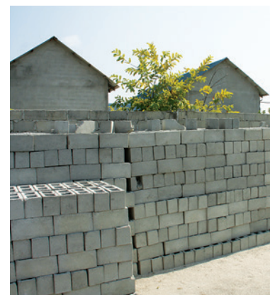
The waste management centre under construction on Vaikaradhoo Island, Maldives

The community made a cash contribution of US$3,892.